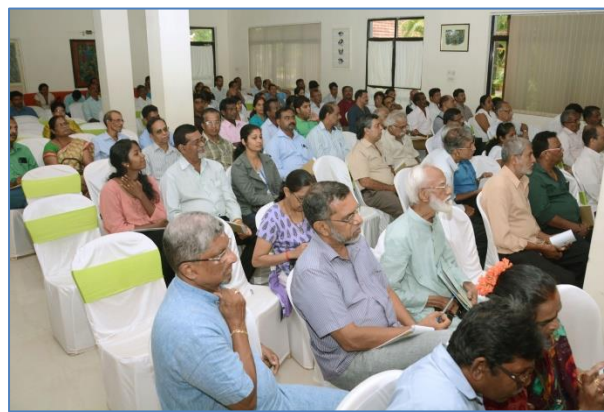
Section of the Audience during the inaugural session of IDB 2015