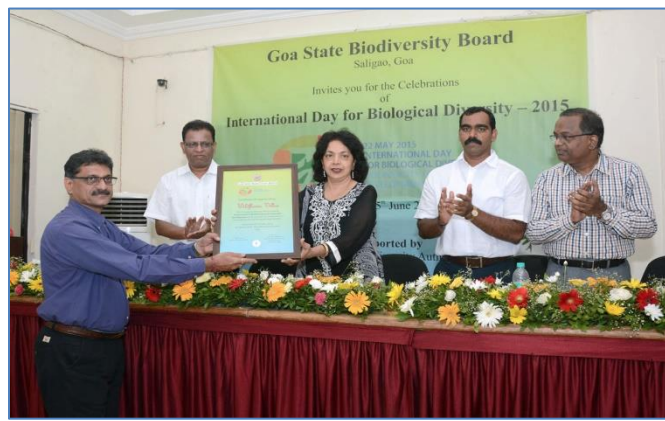
Proprietor of 'Wildflower Villas' receiving the Certificate of Appreciation on the occasion of celebration of IDB- 2015