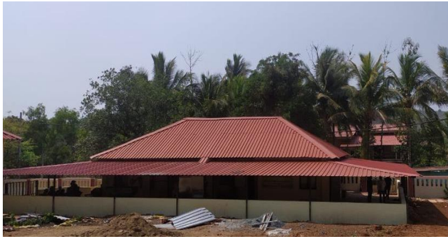
Multi-processing Centre Setup at Pali- Cotombi, Bicholim Goa

Shrithal BMC and other members receiving Goa Biodiversity Awards -2020 (BMC Category) North Goa, on behalf of Shrithal BMC.