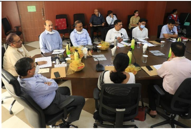
One-day State level workshop on State Action Plan for Climate Change