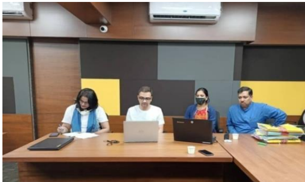
Yuva Jagruti-2021 virtual celebration