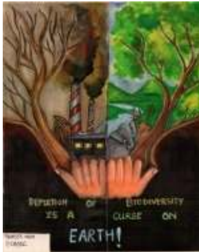
1 st prize: People's High School

Theme for poster competition: Conservation of wetlands/ climate change/ conservation of biodiversity.