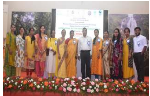
Member Secretary, GSBB along with the Staff of GSBB during International Day for Biological Diversity on 22 nd May 2018