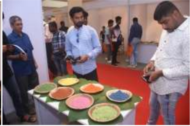
Biodiversity lovers visiting stalls at Biodiversity Exhibition during the celebration of International Day for Biological Diversity on 22 nd May 2018