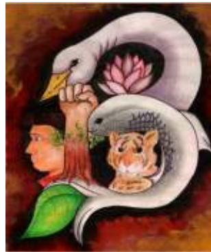
2 nd prize: Dr. K.B. Hedgewar High School