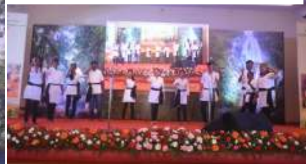
Students of S. S Anle Higher Secondary School- winner of street play competition performing the street play during International Day for Biological Diversity on 22 nd May 2018