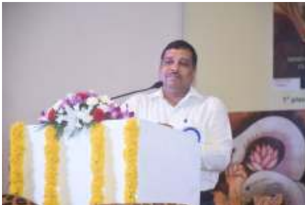
Member Secretary, GSBB giving a welcome address and remarks on IDB theme and information on significant activities of GSBB during the inaugural function of International Day for Biological Diversity on 22 nd May 2018