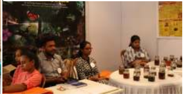
'Honey Bank' stall was installed by GSBB at Biodiversity Exhibition during the celebration of International Day for Biological Diversity on 22 nd May 2018