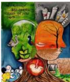
1 st consolation: Sarvodaya E. S. High School