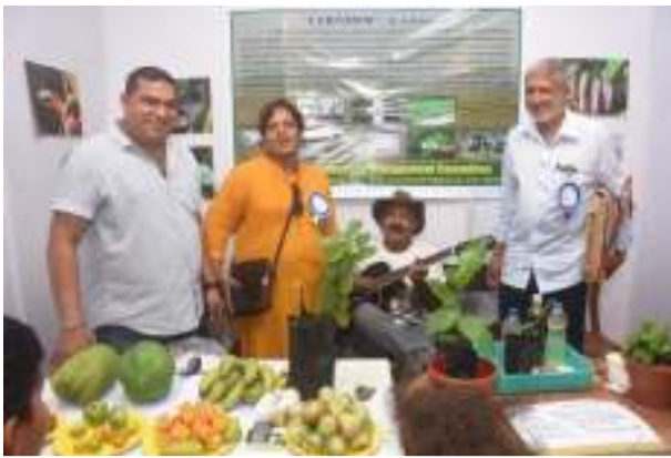
Enthusiastic biodiversity lovers on BMC stall singing biodiversity songs at Biodiversity Exhibition during the celebration of International Day for Biological Diversity on 22 nd May 2018