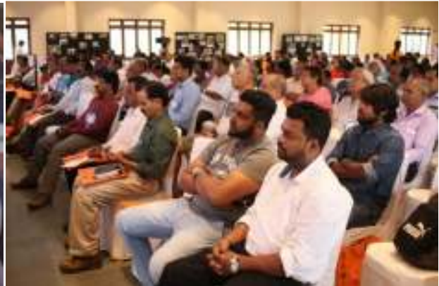
Participants listening attentively to the speakers during the celebration of International Day for Biological Diversity on 22 nd May 2018