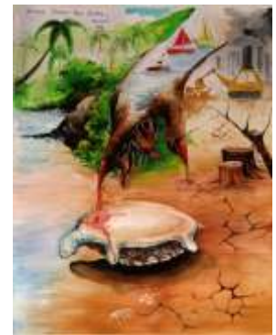
3 rd prize: Bethany Convent High School