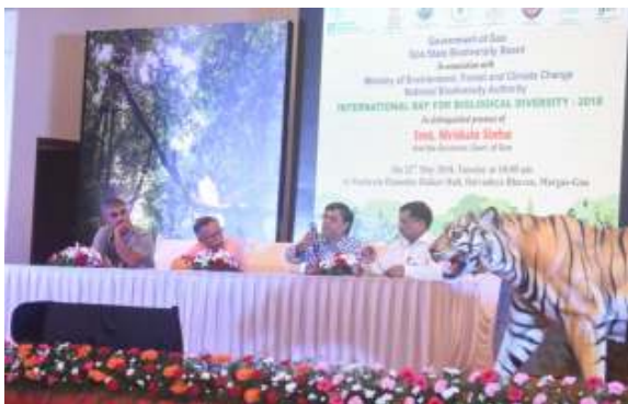
Expert Members of Goa State Biodiversity Board guiding the members of BMC's at the time of interactive session held during International Day for Biological Diversity on 22 nd May 2018