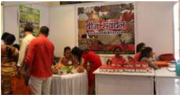
'Seed Conservation' (बीज संवर्धन) stall was installed by GSBB at Biodiversity Exhibition during the celebration of International Day for Biological Diversity on 22 nd May 2018