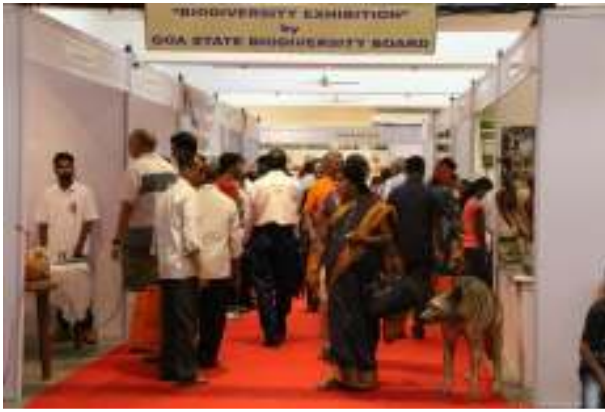
Biodiversity lovers visiting stalls at Biodiversity Exhibition during the celebration of International Day for Biological Diversity on 22 nd May 2018