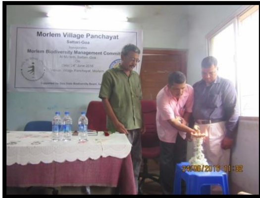
Lightning of the traditional lamp