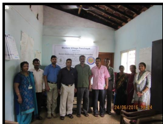
GSBB staff with Morlem BMC members