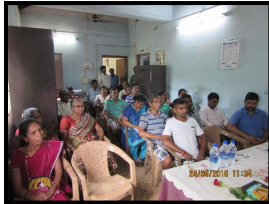
Villagers present for inauguration programme