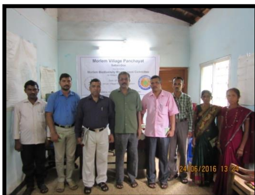
MS, GSBB with Morlem BMC members