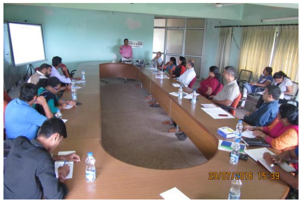
Member Secretary briefing the Members