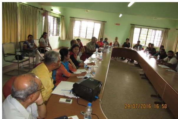
Interactive Session and discussion.