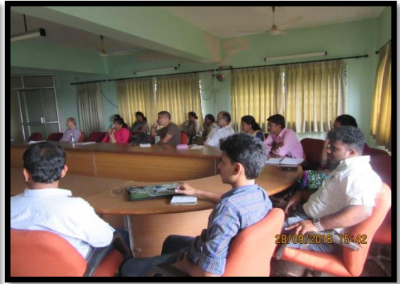
Guiding Committee and TSGs Members present for review meet