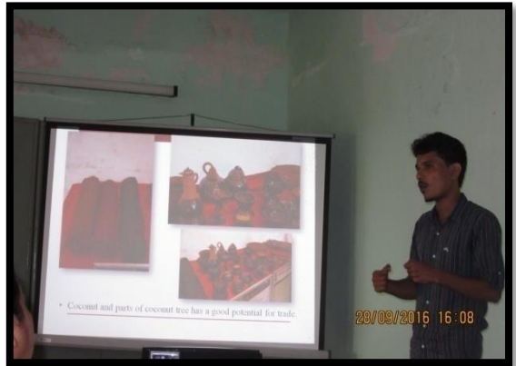
Presentation by TSGs