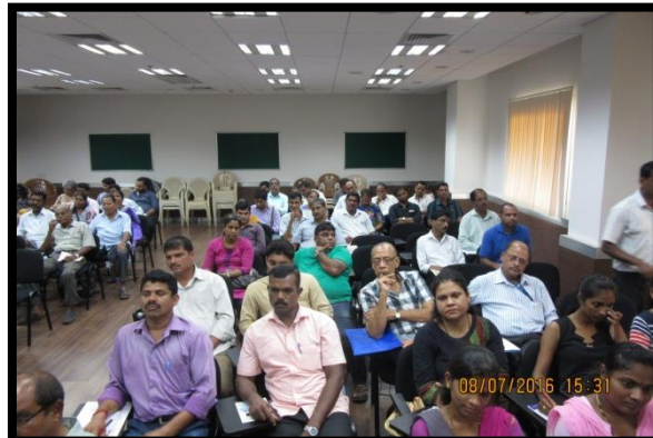
BMC Members participated for Cluster Meeting