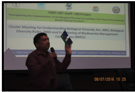
Member Secretary addressing the gathering