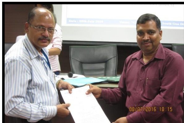
Distributing Cheques for BMCs