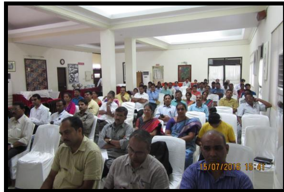
BMC Members participated for Cluster Meeting.