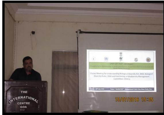
Member Secretary addressing the gathering