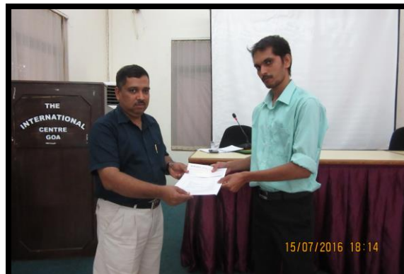
Distributing Cheques for BMCs.