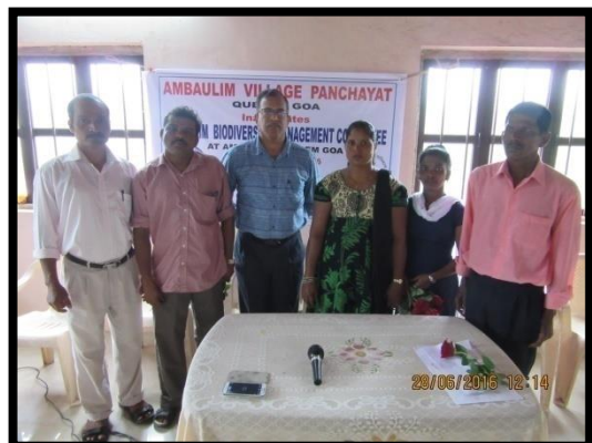
Ambaulim BMC members