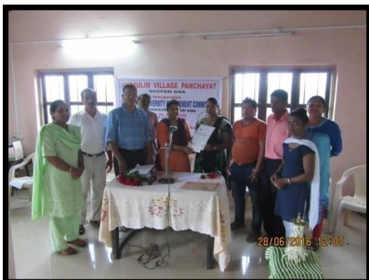
Certificate being handed over to Ambaulim BMC members