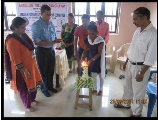
Lightning of the traditional lamp