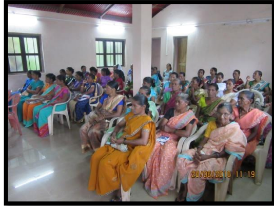
Villagers present for inaugural programme