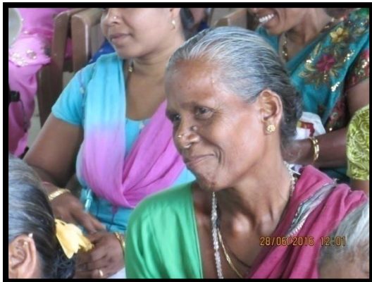
Traditional Health care practitioner of Ambaulim village